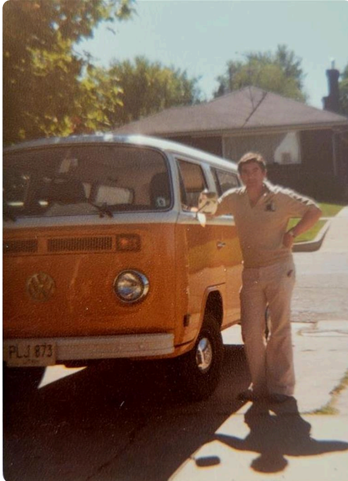
Oh how he loved those VW's. All VW's!